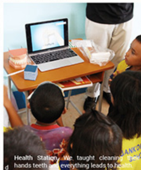
Health Station. We taught cleaning their hands teeth and everything leads to health.