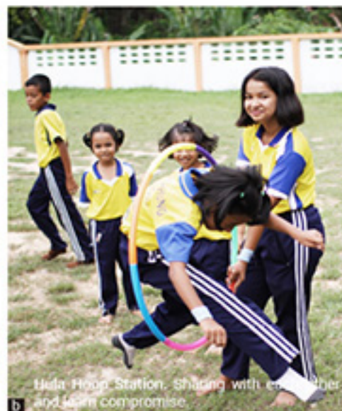
Hula Hoop Station. Shading with english and learn compromise.