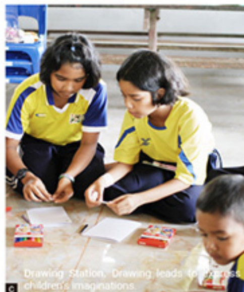
Drawing Station. Drawing leads to express children's imaginations.