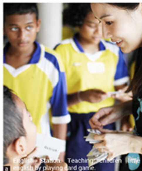
English Station. Teaching children little english by playing card game.

Light Me Up is teamed with 6 business women normally working in Bangkok. They coordinate the place, date, and the contents in the interval of their usual work. Also on this collaboration Light Me Up was the connection with this island.